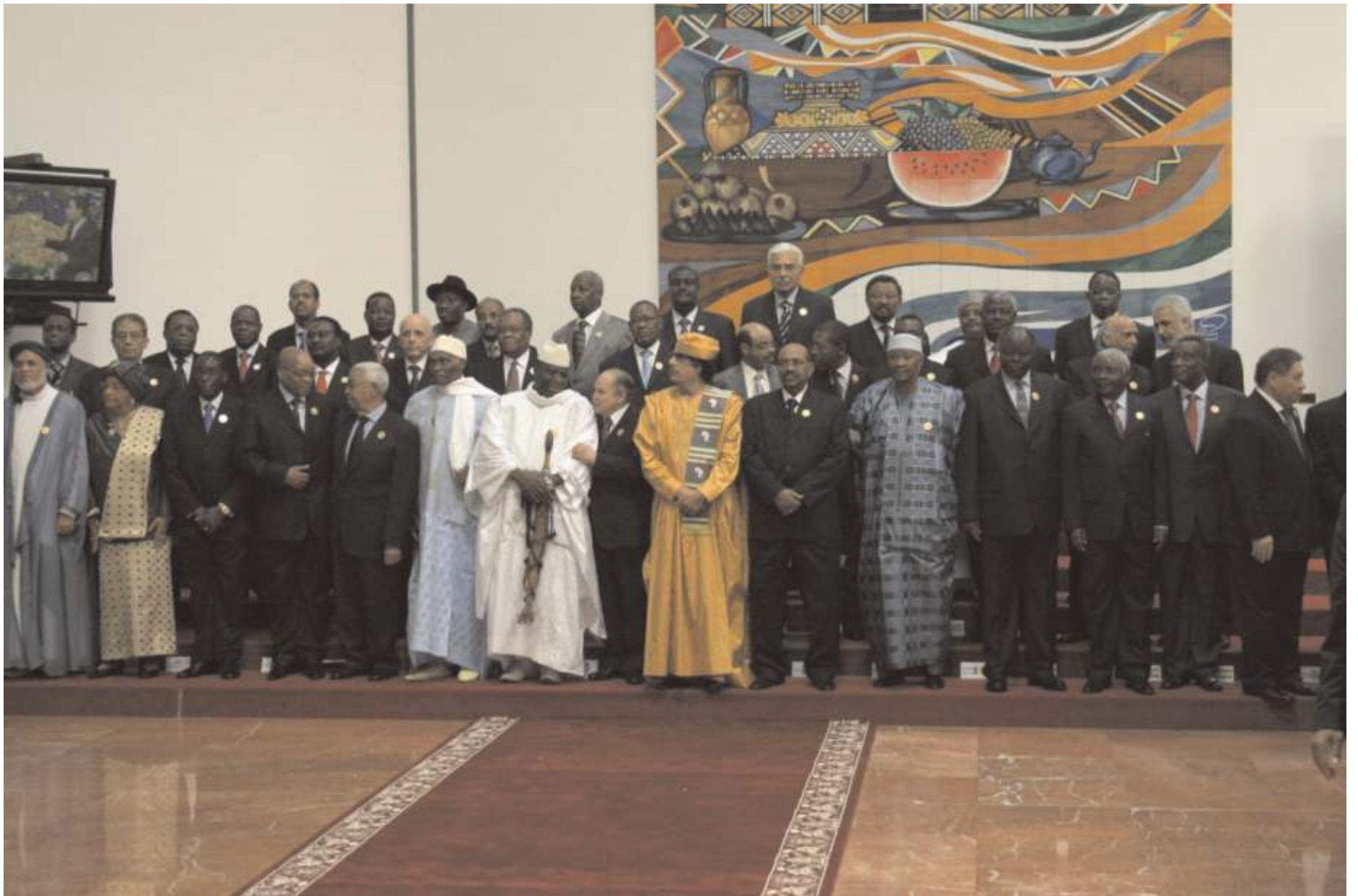
The President of the African Union Muammar Al-Qathafi center with African heads of state and government pose for a phot-op before the opening of the 13th AU summit in Sirte, July 1, 2009.